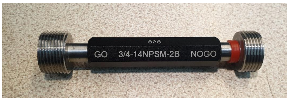
Figure 9 – Example 3/4" NPSM cylinder plug gauge – Left side GO – Right side NO GO