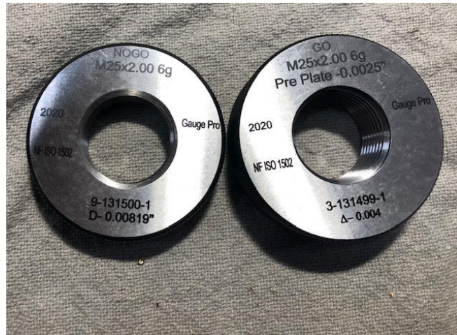
Figure 7 – Example M25 x 2 cylinder valve ring gauges – Left NO GO – Right GO