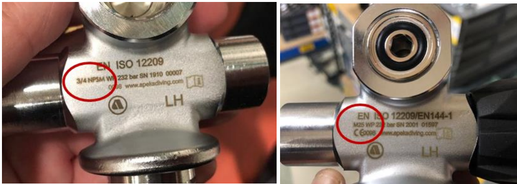
Figure 6 – Example cylinder valves showing 3/4 NPSM (left) and M25 (right) inlet (stem) connection marking

Note: ISO 12209 does not require valves to be marked with the inlet (stem) connection, only the number of the standard, the working pressure and the date of manufacture. Many 3/4" NPSM valves marked with ISO 12209 may not have the connection marked.