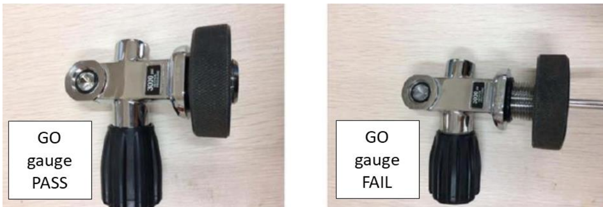
Figure 8 – Cylinder valve GO ring gauge (Left – PASS. Right – Fail)