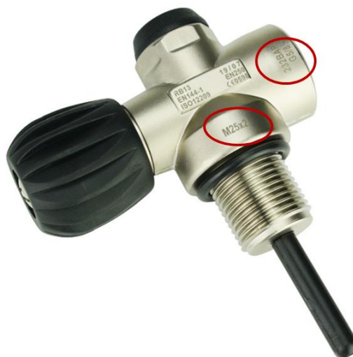
Figure 5 – Example cylinder valve showing marking of M25 x 2 inlet (stem) connection thread and G5/8 outlet connection thread

Examples of different inlet connection thread markings are illustrated in Figure 6.