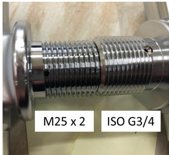
Figure 1 – Visual comparison of M25 x ISO G3/4 threads showing smaller diameter of M25 x 2 thread