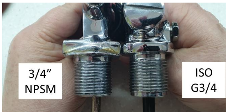
Figure 2 – Visual comparison of 3/4" NPSM and ISO G3/4 threads showing similarity

Investigation of the valve ejection events has consistently identified that a cylinder valve with a smaller diameter stem thread than the cylinder neck thread had been used, e.g. a valve with a M25 x 2 stem thread inserted into a cylinder with a 3/4" NPSM neck thread. It is therefore imperative that the cylinder neck and valve stem threads are identical.