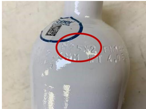
Figure 4 – Example cylinder shoulder stamp marking showing M25 x 2 thread at left side of top row