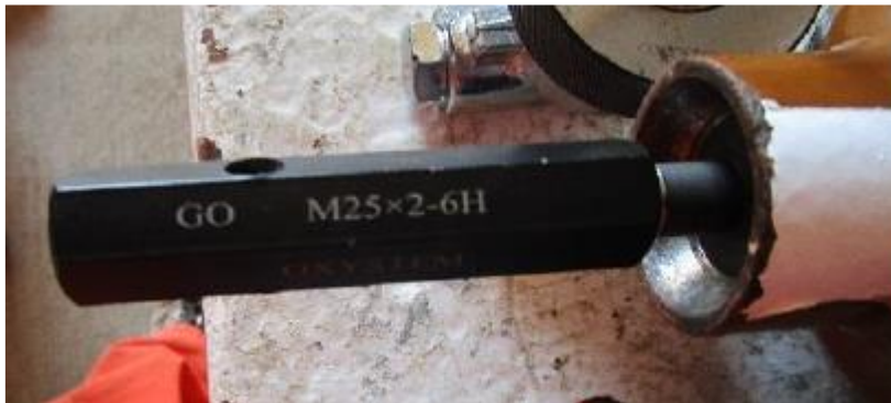
Figure 10 – M25 x2 cylinder plug GO gauge – PASS (fully inserted)